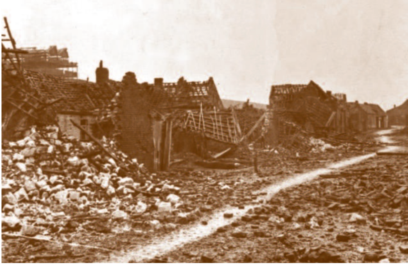
Ruins in the church quarter of Loos, 24th November 1915.

The British offensive in the coal mining area around the village of Loos in Northern France began on 25th September 1915 and continued until the middle of October. Whilst there were early successes, a failure to exploit gains by timely use of reserves undermined the British efforts. The first divisions of Kitchener's "New Armies" of volunteers, in particular, had a difficult time. It was also the first occasion on which the newly formed Guards Division, which included the Welsh Guards, had fought together in a major battle. It was the task of the Welsh Guards to