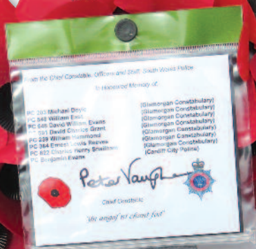
South Wales Police Remembers - Wreath laid at the Loos Memorial, April 2015